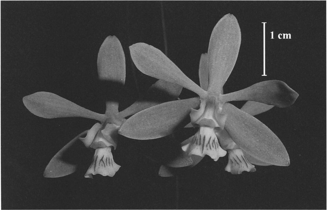
Figure 2. Encyclia garciae-esquivelii Carnevali & I. Ramírez. Flowers (photograph by G. Carnevali, based on G. Carnevali & I. Ramírez 6811).

green, the callus white with a few purple nerves, the column apically white, at base pale yellow-green with 3 faint lines of fine purple dots, the anther dull pink with thick, deep dark purple margins; sepals 7-nerved, elliptic or oblong-elliptic, obtuse or obtusely acute, the laterals very slightly oblique, more attenuated basally than the dorsal sepal, the apex on the external face with dense verrucae and bluntly keeled; dorsal sepal 15.5–16 × 5.5–6 mm; petals 14.8–15.2 × 5–6 mm, 1.5 mm wide at base, 5-nerved, spatulate, obtuse to obtusely acute at apex, apically with a thickened mucro; labellum 3-lobed, the lateral lobes parallel and laxly embracing the column, upon spreading forming an angle of less than 45° in relation to the main labellar axis, 14–15 mm long along its main axis, 13–14 mm across the spread lateral lobes, midlobe 8–9 mm long from the point where lateral lobes arise, broadly obovate in general outline including the basalmost, callus-including section; the blade of the midlobe 6–7 × 9.5 mm, transversally subquadrate-rhomboid, broadly truncate and shallowly emarginated or 2-lobed at apex, the upper surface with the nerves keeled and coarsely verruculose with the verrucae arranged in 8 longitudinal lines; lateral lobes 9–9.5 mm long along the external margin (ontogenetically the most basal), 6–6.5 mm long along the internal margin, ca. 3.5 mm wide at base,